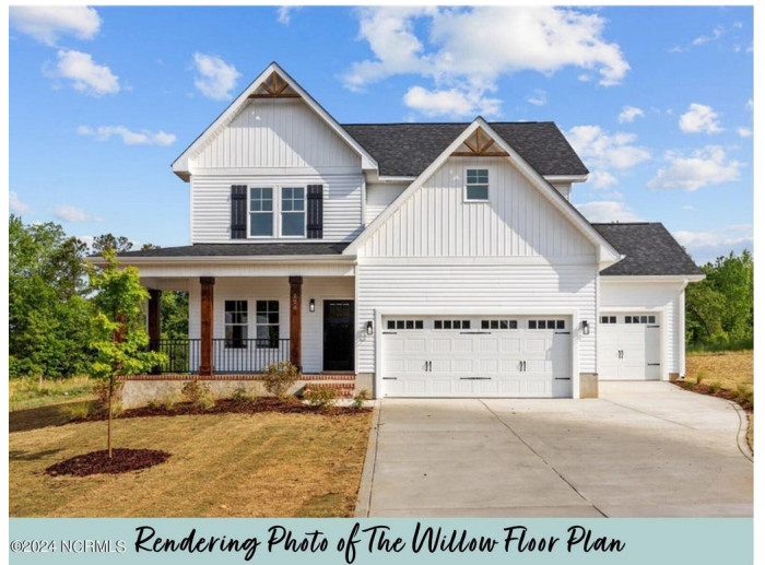
Rendering Photo of The Willow Floor Plan